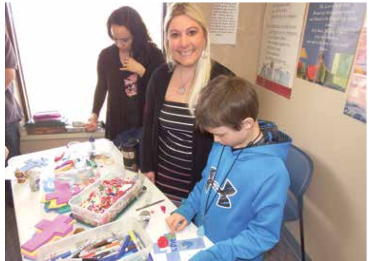
Our First Communion Preparation program seeks to involve families in the process of preparing our students to receive the Eucharist.