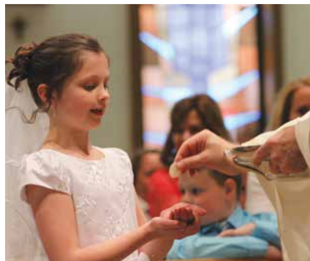
We can often draw inspiration from the joy and excitement of our second-graders as they receive our Lord in the Eucharist for the first time.