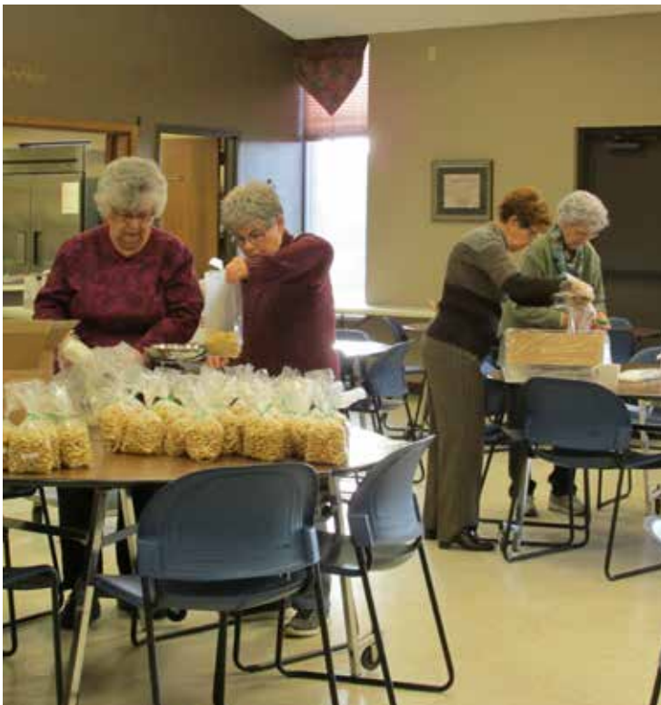
Here, four members weigh and package nuts.

With the New Year approaching, the Ladies of Ascension are focusing on making some important parish kitchen improvements.