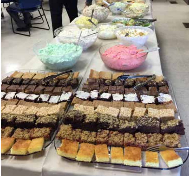
This array of desserts and salads is prepared by the Ladies of Ascension for a funeral luncheon.